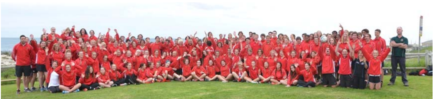
Esperance Senior High School Students at Country Week