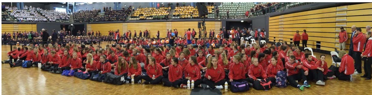
Opening Ceremony for Country Week 2015